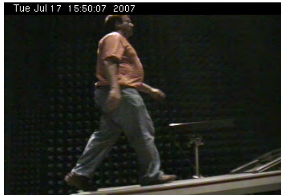
Figure 1. Treadmill.